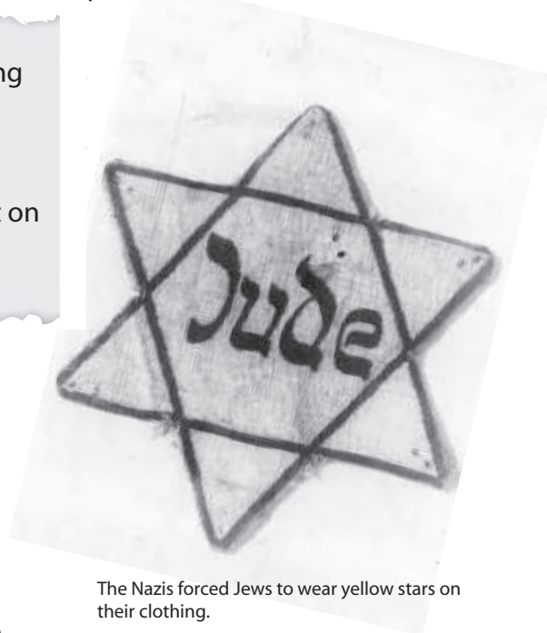
The Nazis forced Jews to wear yellow stars on their clothing.

In the late 1930s and early 1940s, the Nazis made it mandatory for all Jewish people to wear a yellow Star of David with the word “Jew” on the left chest of outer clothing. This visual labeling clearly distinguished Jews from non-Jews. The “Jewish Badge” made it easier for those in power to discriminate against and persecute Jews.