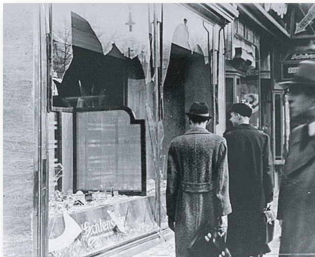
Passersby examine the damage done to a Jewish owned store by the Nazis during Kristallnacht .

In German, Kristall translates to "crystal," meaning broken glass, and Nacht means "night." Because of the huge amount of shattered store windowpanes that covered German streets, these violent attacks came to be called Kristallnacht —"Night of Broken Glass."