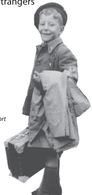
A boy of the Kindertransport departs for freedom.