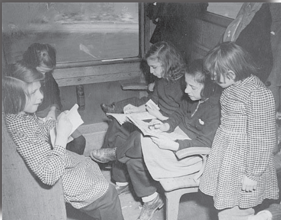
Children traveled without their parents on the Kindertransport .

www.kindertransport.org www2.warnerbros.com/intothearmsofstrangers