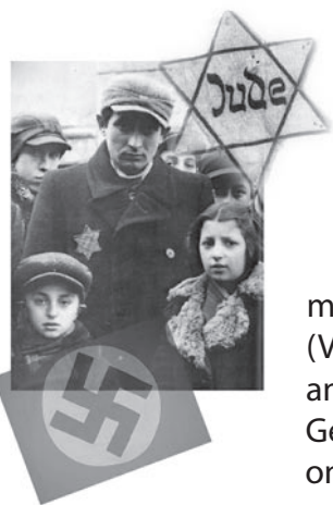
Visual images and symbols are used in the stage production of My Heart in a Suitcase

To present historically accurate visual images, this production incorporates symbols and gestures that are now considered universally offensive: the Nazi swastika and uniform, the "Heil, Hitler" salute, and the six-pointed yellow Star of David inscribed with the word "Jew."