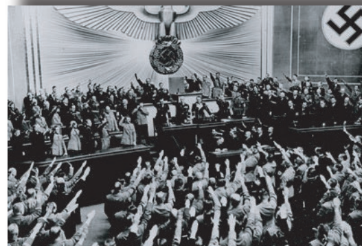
Politicians salute dictator Adolf Hitler - "Sieg Heil!"